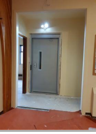
Lift entrance - upstairs