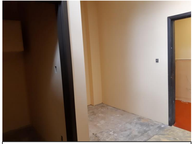
To the Left: entrance to motor room for lift To the Right: extended LCW storage room