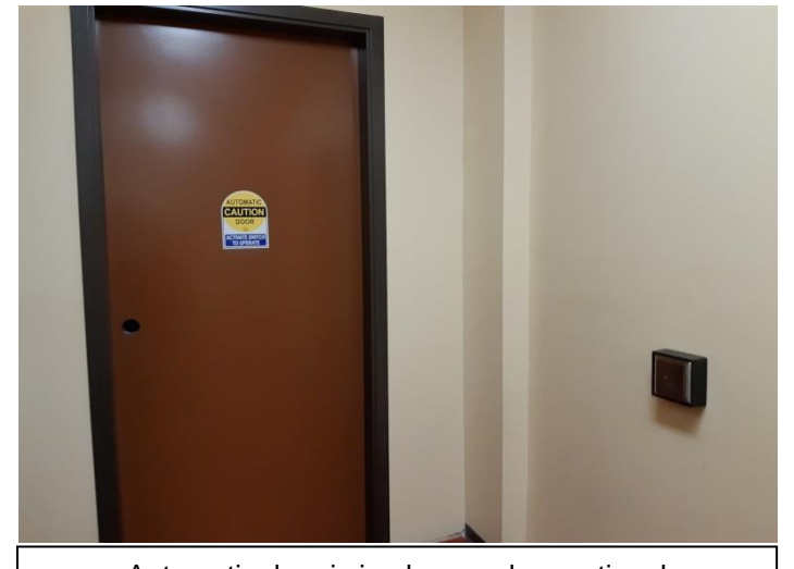
Automatic door is in place and operational

A joint Zoom gathering for Roman Catholics and Lutherans. More info to follow.