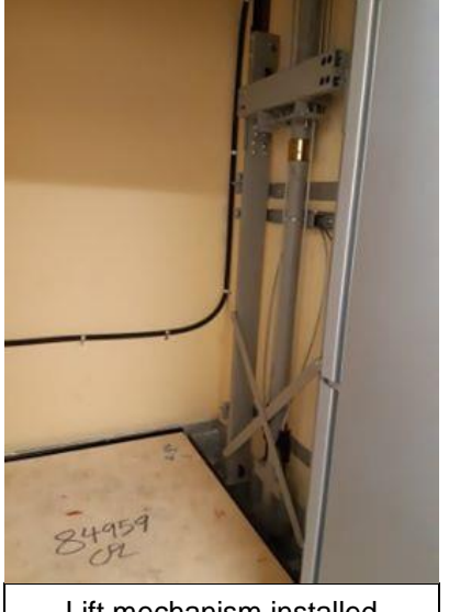
Lift mechanism installed