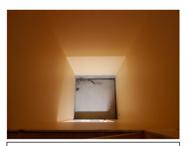
Peering down the lift shaft from upstairs...

Whoo hoo! The lift is expected to be operational in about two weeks, pending inspections by the City of New Westminster and Technical Safety BC.