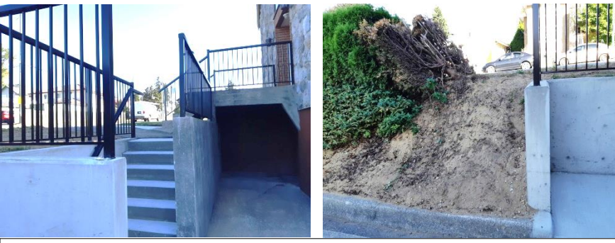
Finally! The cement has been poured...new railings installed...access to the 10<sup>th</sup> Avenue office entrance restored. Now we await restoration of the landscaping!