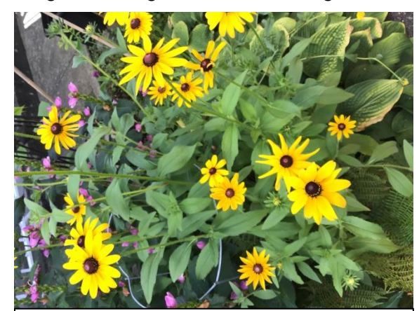
Flowers from Honouring Memories, Planting Dreams seed packet, planted on the day we created the Heart Garden at Mount Zion

Mount Zion's experiments began with the Neighbourhood Book Nook. Hoping to build on this we offered the congregation and neighbours the opportunity to learn more about the legacy left from Residential Schools. We learned and worked together on how we might commit to our own plans toward truth and reconciliation, through Honoring Memories Planting Dreams.